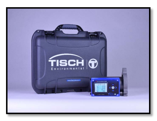
TE-HVC-H Calibration Kit

Proceed with the following steps to begin the calibration: