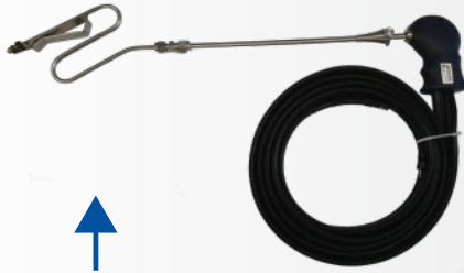
S-Type Probe Fitting & Exhaust Clamp