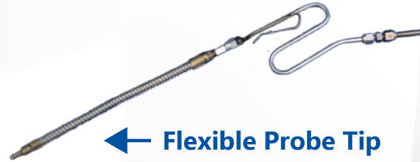
Flexible Probe Tip