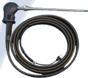
Table C - Sampling Probes and Hoses